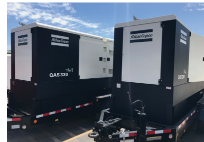
Portable & Standby Generators