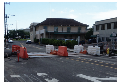
Flanged Road Crossings in a Range of Sizes