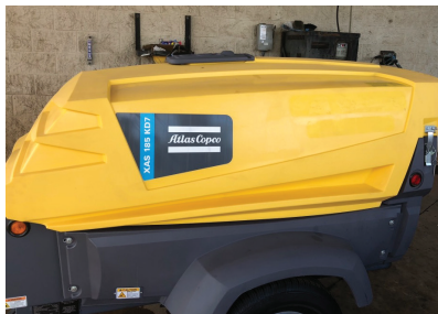
Portable & Industrial Air Compressors