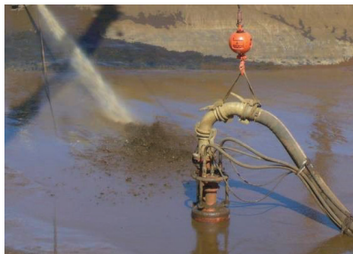
Hydraulic Power Packs & Submersible Pumps