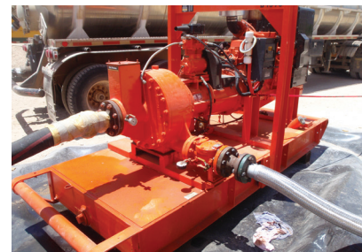
High Head Pumps for Temp Fire and Cleaning